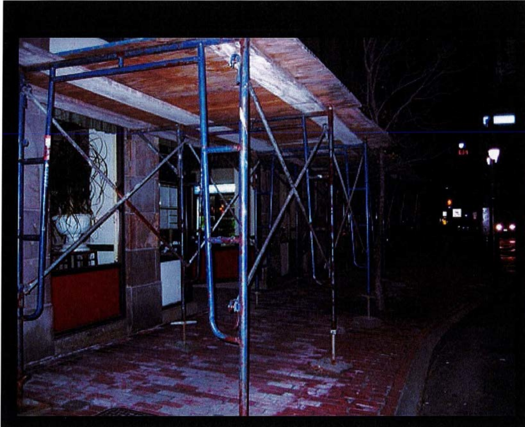
Example of walk-through scaffold with plywood canopy protection